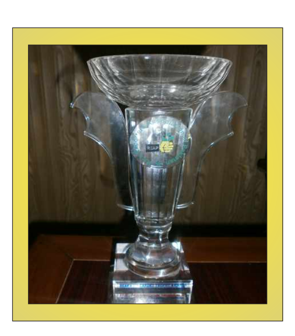
FPCCI TROPHY HOLDER